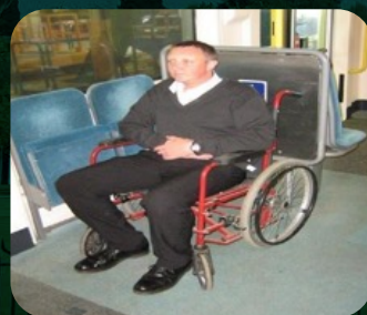
Diagram 1 Wheelchair positioned correctly in bay