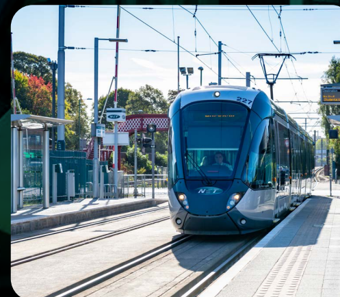
NET tram stop