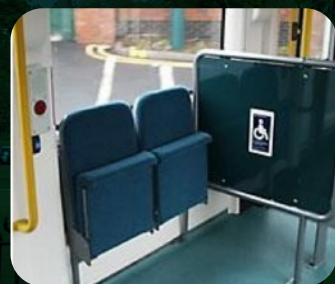
Diagram 1 Wheelchair and Pushchair Bay