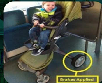
Diagram 3 Pushchair positioned correctly in bay