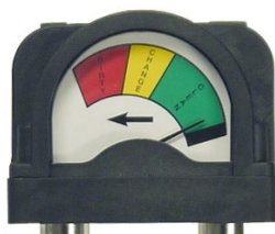
Differential Pressure Gauge