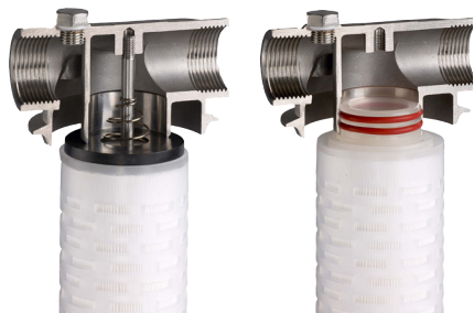
Double Open Ended