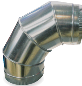
Galvanized Steel Elbow