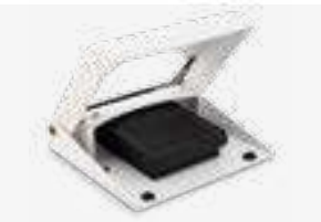
WIRELESS PEDAL Code PL-RIC00305

Universal power supply for Pocket Laser units and wireless foot control. Already supplied when purchasing the Starter Kit