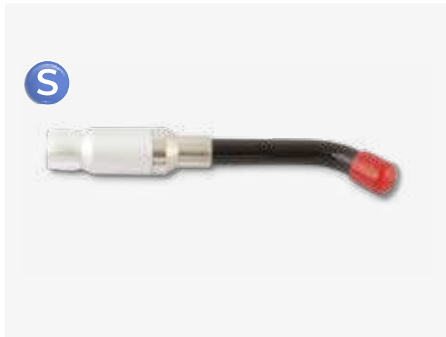
TIP FOR INTRAORAL BIOSTIMULATION code PL-B670-8A