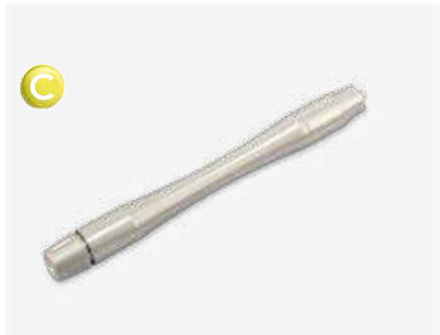
CONTACT SATIN-FINISH HANDPIECE code PL-FT000022