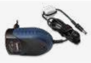
POWER SUPPLY KIT Code PL-RIC00310

For operators and patients, they allow complete protection and can be used with most eyeglasses' frames. PPE for NIR diode lasers. 2 pieces already supplied when purchasing the Starter Kit