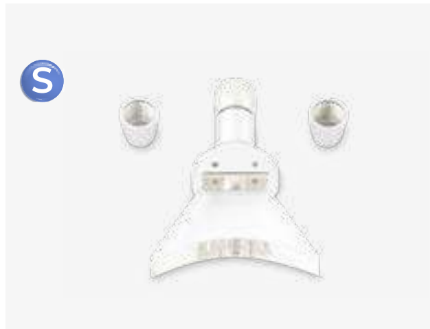
ARC WHITENING TIP code PL-W670