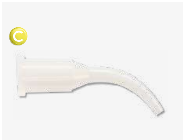
SET OF 20 DISPOSABLE WHITE MAC TIPS code PL-FT000015