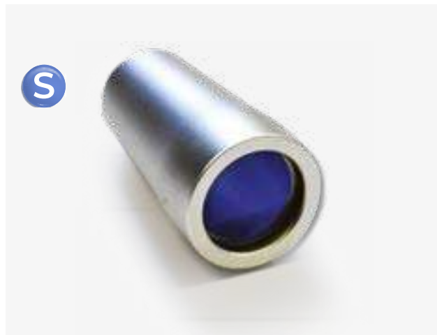
COLLIMATED TIP code PL-TM670-10