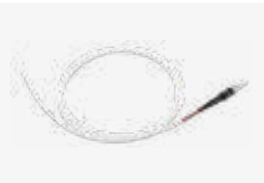
2 MT 200 µm ULS OPTICAL FIBER Code PL-LPA00201