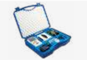
CASE FOR POCKET LASER Code PL-LDA00202

4200 MAH, 3.7 V battery. Already supplied when purchasing the Starter Kit