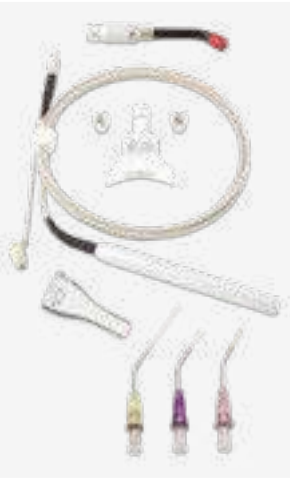
MULTIFUNCTIONAL KIT for biostimulation and whitening including tips - Code PL-MF-TIPS

Already supplied when purchasing the sapphire handpiece