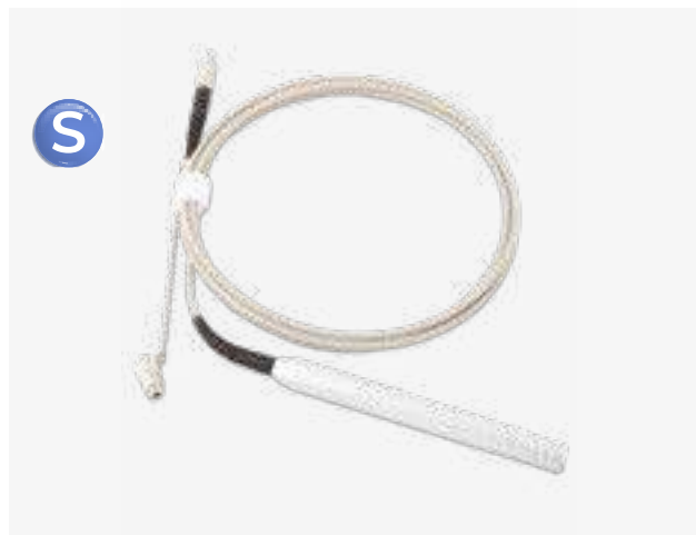
SILVER HANDPIECE code PL-HPD-311S08-S