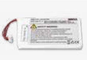
BATTERY FOR POCKET LASER UNIT Code PL-RIC00309

Wireless pedal with long-life battery for “hands free” use. Each pedal is set to respond only to a single Pocket Laser unit. Already supplied when purchasing the Starter Kit