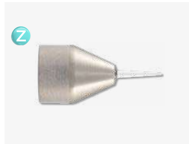
CONICAL SAPPHIRE TIP code PL-ZCT500