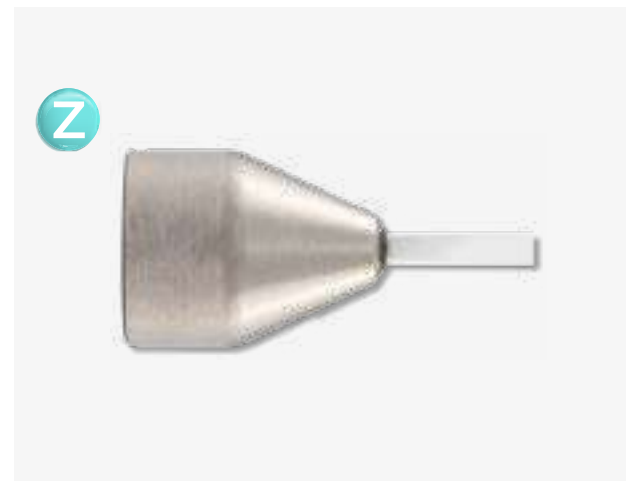
CHISEL SAPPHIRE TIP code PL-ZST600