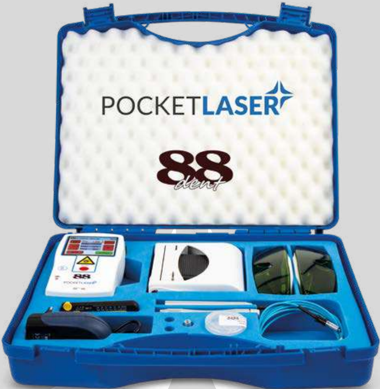
photo above - Advanced Kit