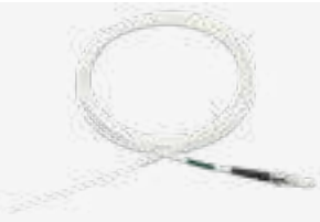
2 MT 300 µm HCP OPTICAL FIBER Code PL-LPA00300

With SMA 905 coupling. Ready-to-use optical fiber (without polymeric coating). Simple to use. Universal, conservative, prosthesis. Autoclavable.