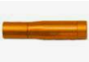
FLAT WAVE TIP Code PL-BT5008

With SMA 905 coupling. High resistance optical fiber with polymeric coating. Universal, conservative, prosthesis. Autoclavable.