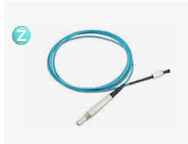
SAPPHIRE HANDPIECE code PL-LHC3000