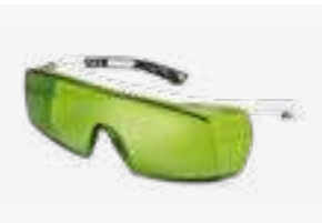
WHITE GLASSES with green lenses Code PL-LDA00105