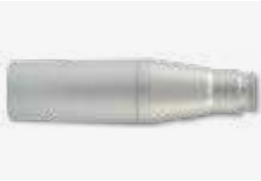
SAPPHIRE TIPS ADAPTER Code PL-LPC3002

Innovative defocused terminal with high performance for biostimulation, low level laser therapy, analgesic and anaesthetic therapy applications. IP