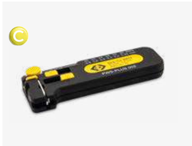
FIBER CUTTER KIT code PL-LDA00013