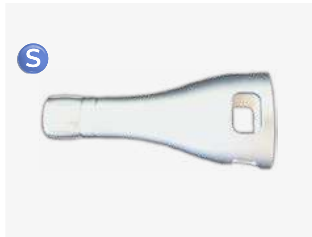
TIP FOR EXTRAORAL BIOSTIMULATION code PL-TM670