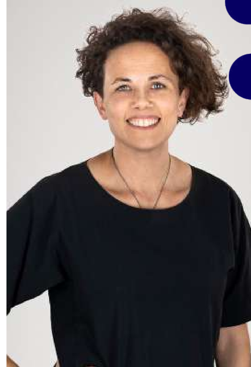
Vice President, Head of Transit & Micromobility Policy