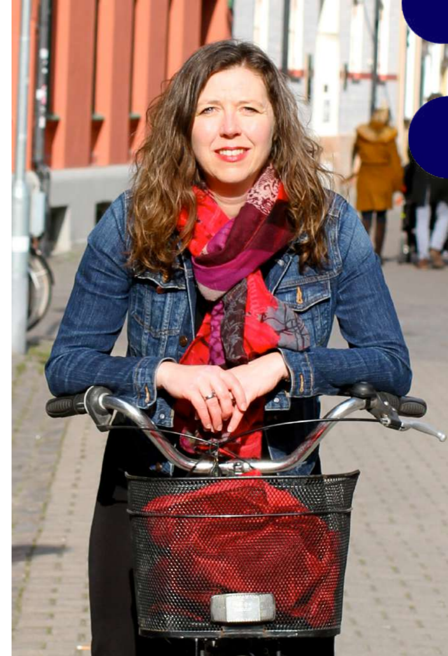
Market Manager Global Smart Mobility