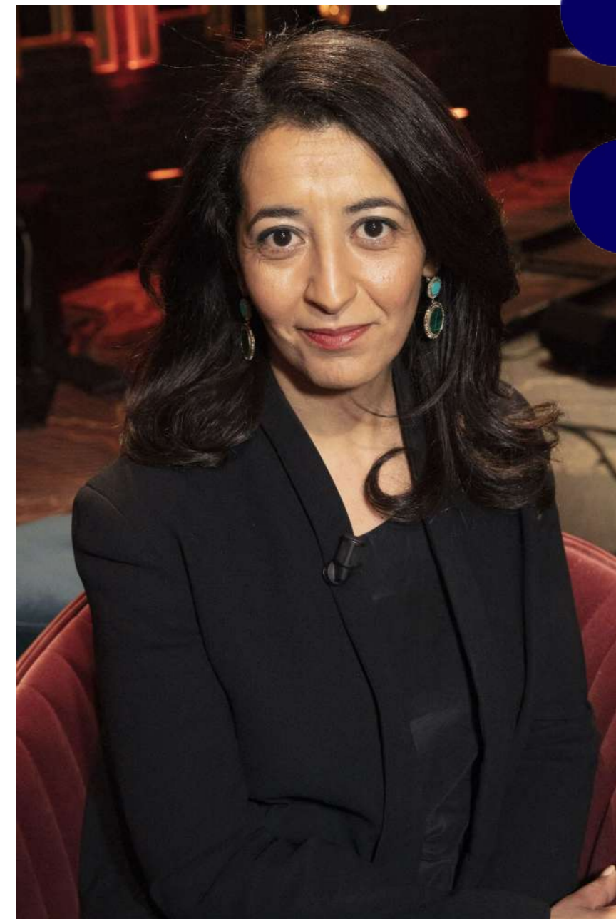
Chairperson of the Transport Committee