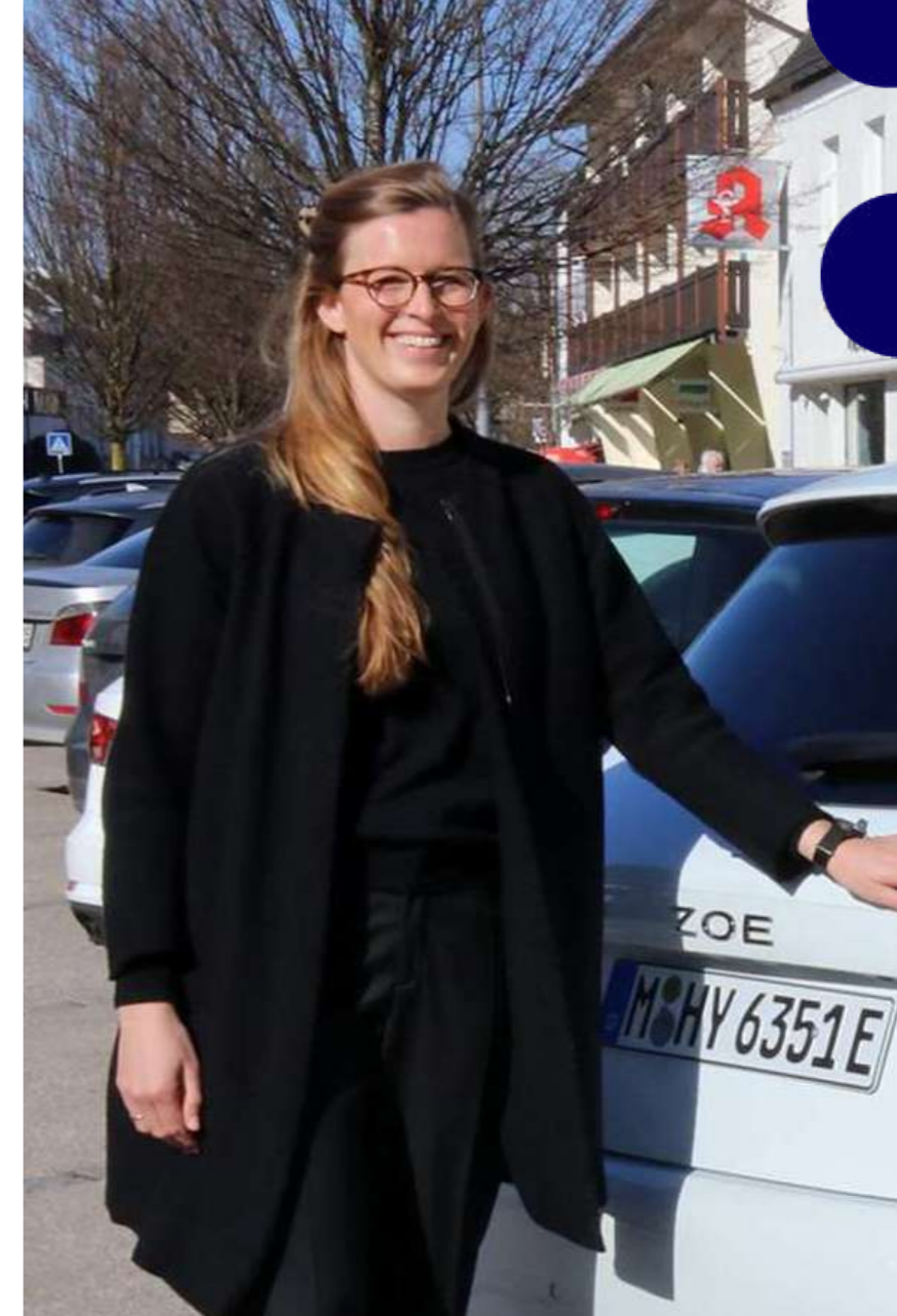
Executive Director Sixt Share