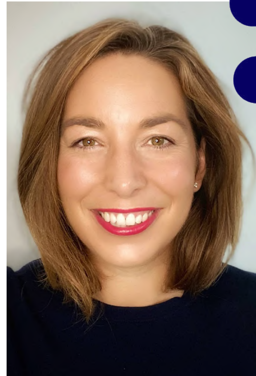
Chief Product Officer