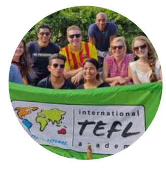
Attend ITA Meetups Around the World