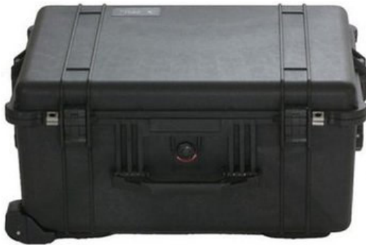
Pelicanshipping case large model