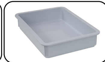
FSB-DT18133 17-3/4"L x 12-3/4"W x 3-3/8"H "ARTISAN DOUGH TRAY"