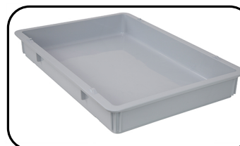
FSB-PT26183 25-5/8"L x 18"W x 3-3/8"H