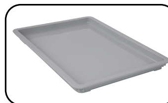
FSB-PL2618 25-5/8"L x 18"W x 1-3/4"H