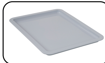
FSB-DL1813 17-3/4"L x 12-3/4"W x 3/4"H "ARTISAN LID"

Precision engineering and design ensures a space-efficient and secure stacked configuration to reduce the need for extra lids, while keeping ideal moisture and temperature for the yeast to grow. The boxes withstand temperatures ranging from -40°F to 160°F.