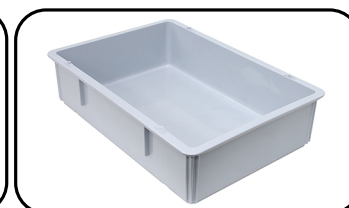
FSB-PT26186 25-5/8"L x 18"W x 6-3/8"H