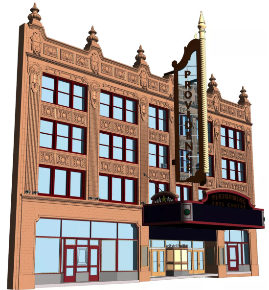
View of 3D BIM Model and Exterior Elevation – Providence Performing Arts Center, Providence, RI