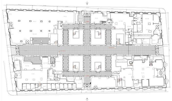
3D BIM Model and First Floor Plan – 120 Broadway, New York, New York