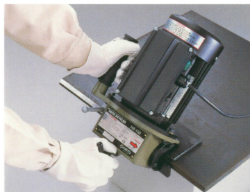
Beveling steel plates