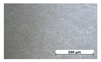
Microstructure after stress relief