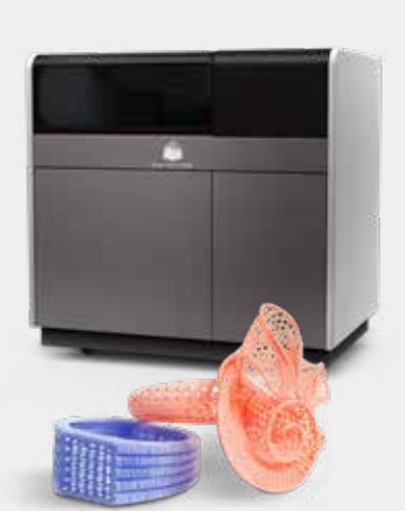
Figure 4 for Jewelry Casting Patterns, Master Patterns for Mold Making, and Prototyping