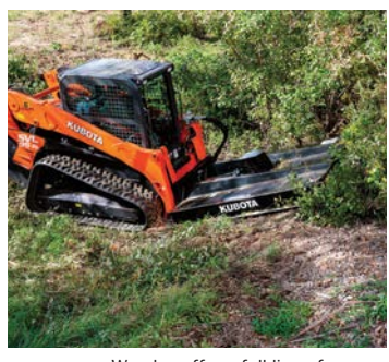
We also offer a full line of skid steer attachments.