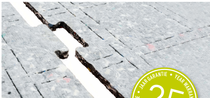
Puzzle shaped ProPlay® sheets with expansion slots