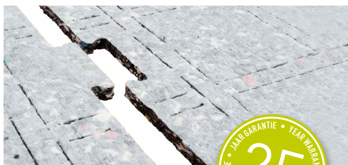
Puzzle shaped ProPlay® sheets with expansion slots