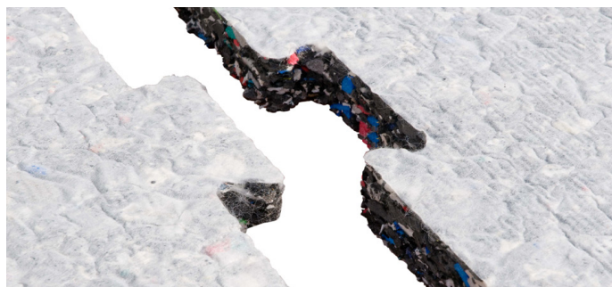
Puzzle shaped ProPlay ® sheets