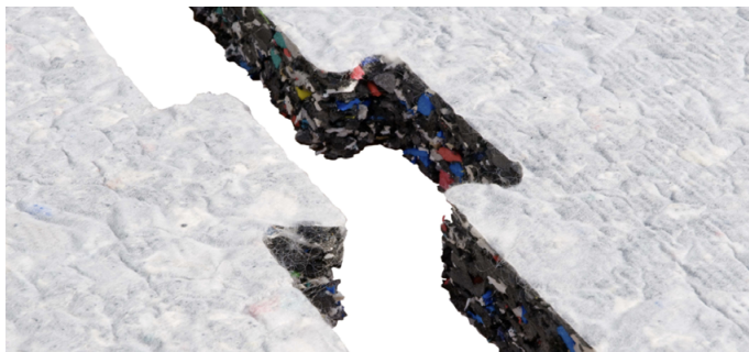
Puzzle shaped ProPlay® for Playgrounds fall protection pad.