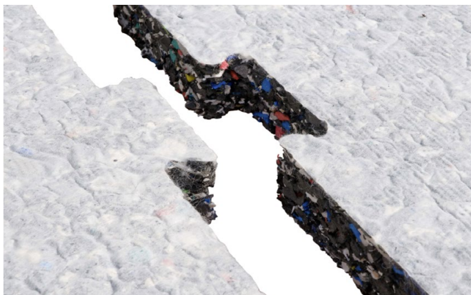
Puzzle shaped ProPlay® for Playgrounds fall protection pad