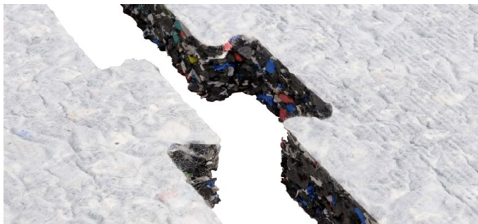
Puzzle shaped ProPlay® for Playgrounds fall protection pad