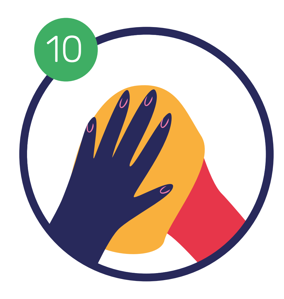
Dry with a clean towel or tissue