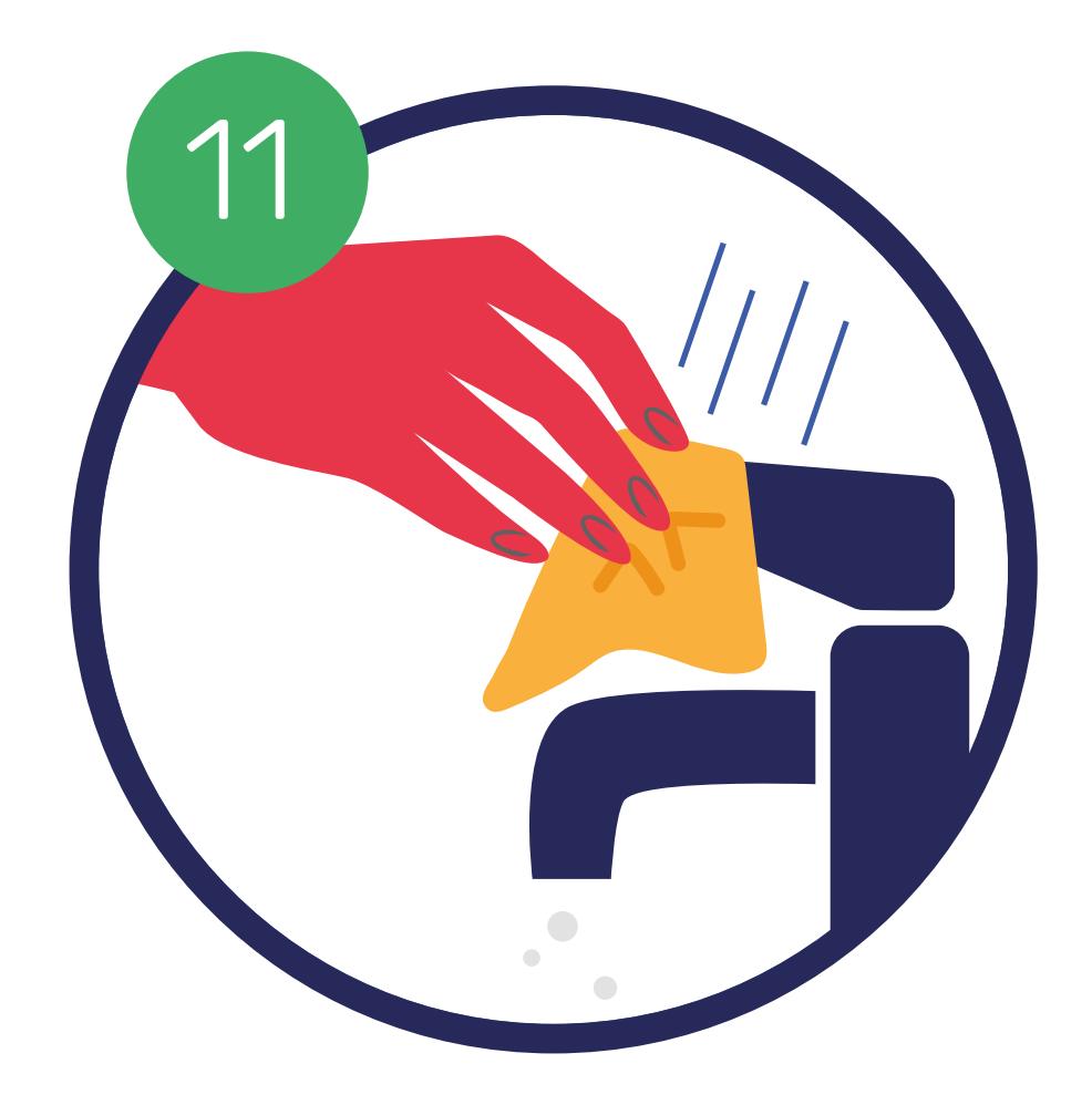
*Do not turn the faucet off with clean hands. Use a paper towel