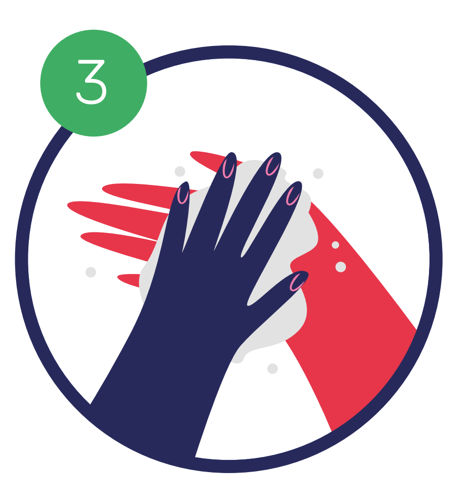
Rub hands palm to palm