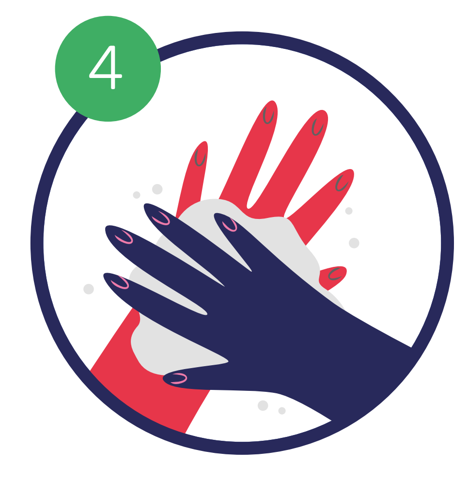
Rub back of hands