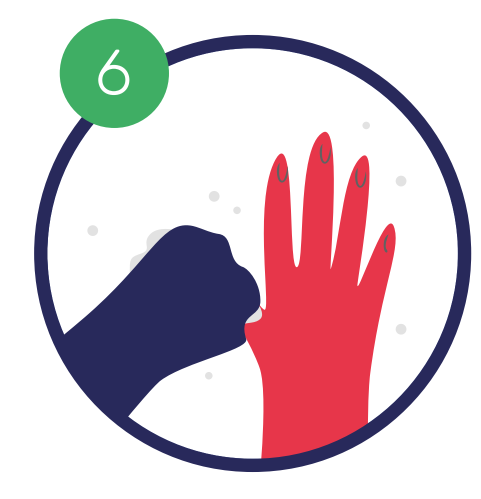
Base of thumbs