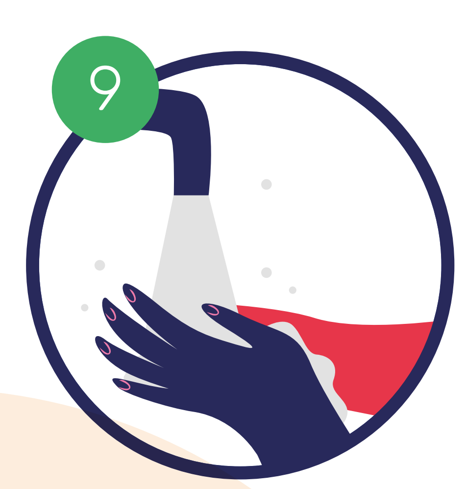
Rinse hand well