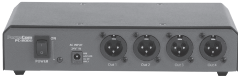
PC-2000 Power Console