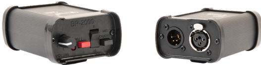
BP-2000 Belt Pack