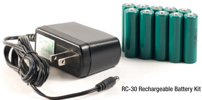
RC-30 Rechargeable Battery Kit