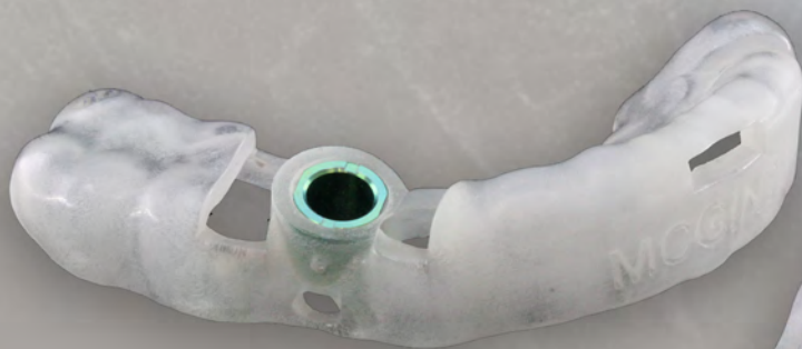
Single Surgical Guide

Focal Point™ by Pittman Dental Laboratory provides this simple, easy to use guided implant system. Pittman Dental Laboratory has been providing the highest quality materials and craftsmanship for the dental industry since 1974. Because of our reputation for quality and service, we are supplying doctors throughout the United States. If you are looking for a reliable dental laboratory for your practice and clients, Pittman Dental Laboratory is here for you.