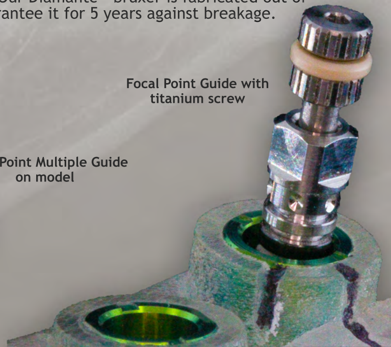
Focal Point Guide with titanium screw