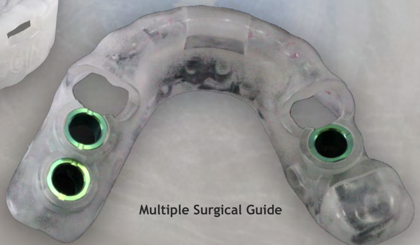
Multiple Surgical Guide