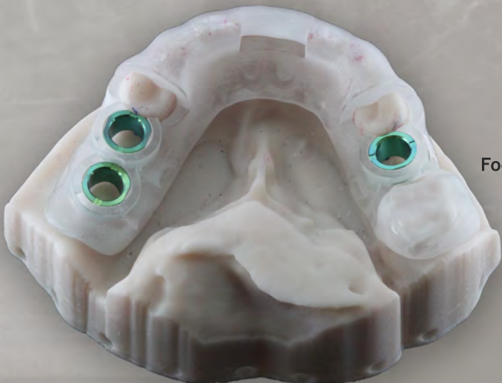
Focal Point Multiple Guide on model

Final Prosthesis - Diamante™ Zirconia bruxer is ideal for final restorations. We mill from a medical grade Zirconia imported from Italy. Our Diamante™ bruxer is fabricated out of all Zirconia, there's no ceramic layering, so we guarantee it for 5 years against breakage.