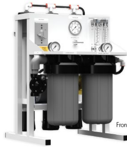
CSROAT01 1000-gallon capacity system