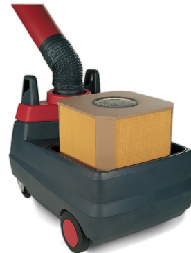
Filter shown inside Mobiflex® 200-M (cover removed)