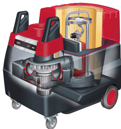
Internal view of Mobiflex® 400-MS showing RotaPulse® self-cleaning filter mechanism.