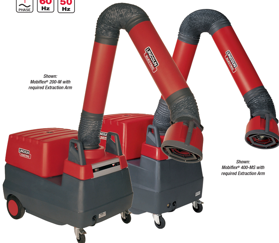
Shown: Mobiflex® 200-M with required Extraction Arm