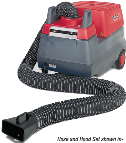
Hose and Hood Set shown installed on Mobiflex® base unit

Hose and Hood Set Flexible extraction hose with magnetic hood set. Ideal for those hard to access fume extraction applications. Hose is reinforced with outside steel rings to protect against wear and crushing. Diameter of hose is 5.75 in. (146 mm), length is 16.4 ft. (5 m). Includes one clamp. Order 7900068030