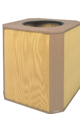
Mobiflex® 200-M Filter