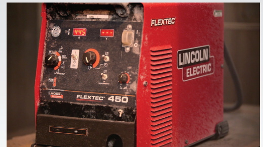
Among other tests, the Flextec™ 450 was subjected to extreme temperature environmental testing, including heat, cold, humidity, rain and dust.

IP23 Rated – While the fan is operating, the machine is subjected to a rain shower that directs water 60 degrees from vertical. While the machine is still wet, it must withstand a high voltage dielectric test and an insulation resistance test.