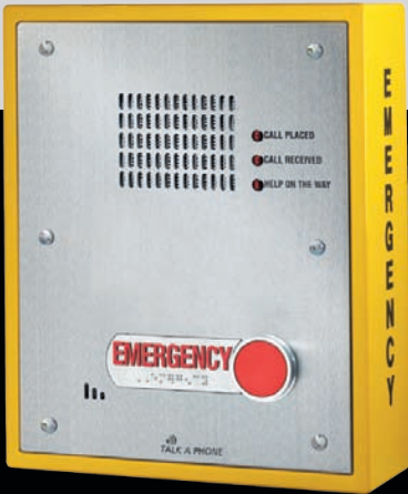
4 VoIP EMERGENCY PHONE (SHOWN IN SURFACE MOUNT)