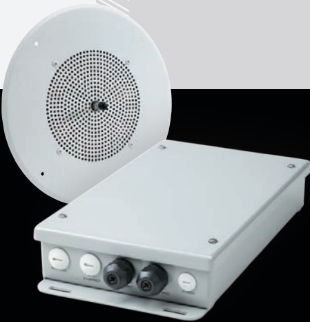
2 WEBS® COMMUNICATIONS MODULE