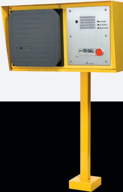
6 GATE ENTRY PEDESTAL WITH CALL BOX AND CARD READER