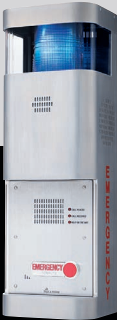
3 WEBS® WALL-MOUNTED CALL BOX