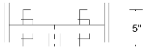
Detail of Tower Base