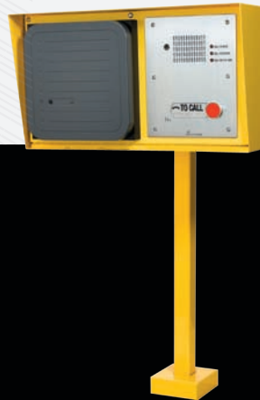
7 GATE ENTRY PEDESTAL WITH CALL BOX AND CARD READER