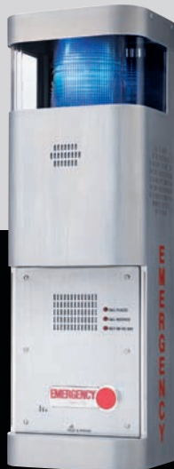
3 WEBS® WALL-MOUNTED CALL BOX