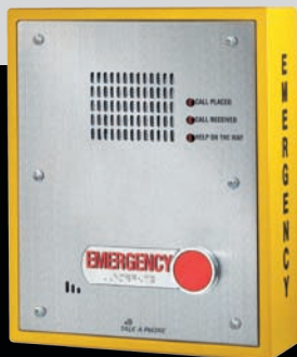
5 VoIP EMERGENCY PHONE (SHOWN IN SURFACE MOUNT)