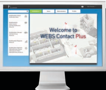
1 WEBS CONTACT PLUS™