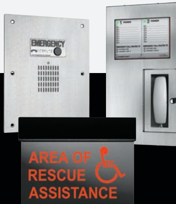
8 AREA OF REFUGE SYSTEM