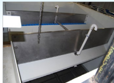
Stage 3: MULTIWASH Trough

The filter is backwashed with WesTech's MULTIWASH® filtration process, which simultaneously combines air and water for the duration of the backwash process. This combination vigorously scours media, while specially designed wash trough baffles eliminate media loss. MULTIWASH's superior media cleaning process prevents chemical and biological fouling, eliminating expensive media replacement or chemical cleaning.