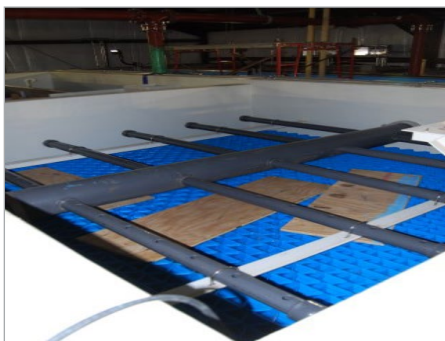
Stage 1: Tube Settling

The process begins with the addition of a cation coagulant and polyaluminum chloride, which are injected into the raw water ahead of the system's static mixer. An anionic flocculant aid polymer is added just ahead of the tank to assist in floc formation. The chemically treated water enters at the bottom of the unit and flows upward through the section