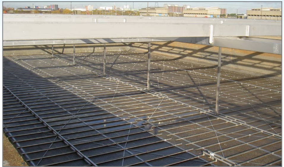
With more than 3000 installations worldwide, the ZICKERT Shark is ideal for wastewater treatment plants and performs well in all sedimentation processes.