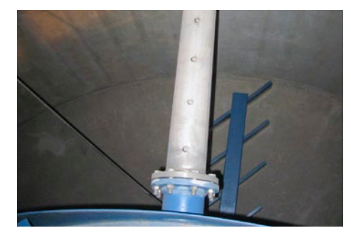
Weir and Rake Arm