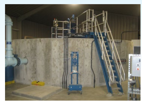
Solids CONTACT CLARIFIER™

With unmatched customer service, WesTech's CONTACT CLARIFIER and Ultrafiltration Membrane System supplied a long-term, high-quality treatment solution to meet the drinking water needs for the Town of LaBarge.