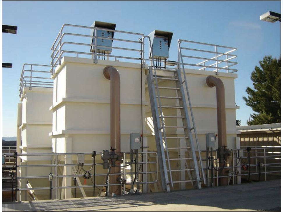
With the help of WesTech's SuperSettler lamella plate clarifiers, CLWA was able to increase total plant capacity while consistently meeting turbidity requirements.

Plant operators are pleased with the performance of the plate settlers. With the help of WesTech's SuperSettler lamella plate clarifiers, CLWA was able to increase total plant capacity, in a small footprint, to 56 MGD while consistently meeting turbidity requirements.