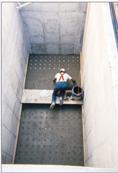
MULTICRETE II retrofit requires less concrete

The plant selected the MULTICRETE II underdrain retrofit solution for two key reasons. First, the MULTICRETE II underdrain is well suited for Wheeler Bottom underdrain retrofits. Similar to the Wheeler Bottom underdrain, the MULTICRETE II underdrain is based on a monolithic concrete design. The design similarities between the two types of systems make it possible to perform a retrofit without extensively reshaping the filter floor, which would require extra time and expense. Because of the similarities, the MULTICRETE II underdrain allowed continued access to the plenum area through an existing access hatch.