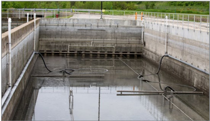
Sludge Sucker unit near Oswego, IL.

The Sludge Sucker™ sludge removal system collects sludge in surface water applications and effectively removes light sludges such as alum or ferric hydroxide or light iron and manganese precipitates in potable water supplies.