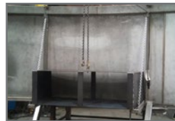
Hinged Ballast Block Shelf