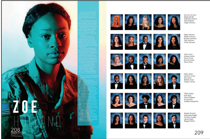
Little Rock Central High School, 2020