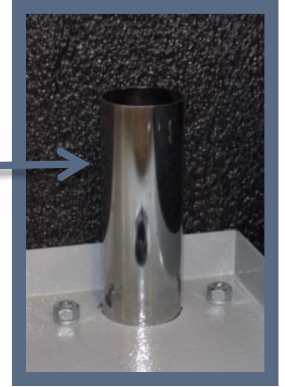
Temperature probe installed. Temperature control activated at 30°F