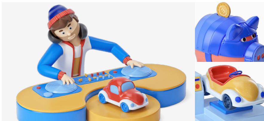
Wakam's new rebrand

Wakam (Ex-La Parisienne Assurances), are helping pioneer a new type of insurance platform - Insurance Product as a Service (IPaaS) to automate claim management. Being an insurance company that is almost 200 years old (yes it was founded in 1829!), they know how important it is to continually innovate to retain their leading market position.