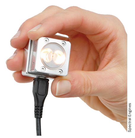
Figure 1. The NIRONE sensor weighs 15 g, and incorporates a MEMS Fabry-Pérot interferometer, an InGaAs photodetector, two tungsten lamps, and all of the control, processing, and communication electronics into one 2.5- \times 2.5- \times 1.75-cm box.

time, but so, too, did Perkin-Elmer Inc. and Applied Physics Corp<sup>3</sup>.