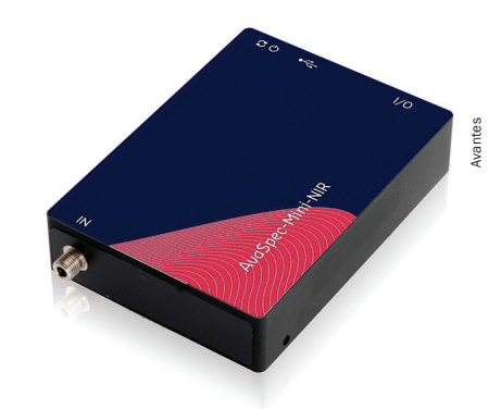
Figure 3. The AvaSpec-Mini-NIR symmetrical Czerny-Turner spectrometer.

Additionally, these MEMS spectrometers can be coupled with modern wireless communications technologies. This creates distributed networks scalable up to thousands of NIR sensors in an intelligent cloud for fast data collection and analysis. These networks can be distrib-