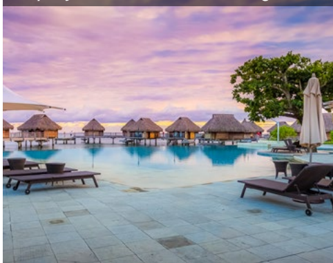
Infinity Pool and Overwater Bungalows