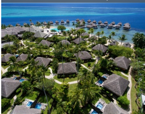
Hotel Manava Beach Resort & Spa Moorea