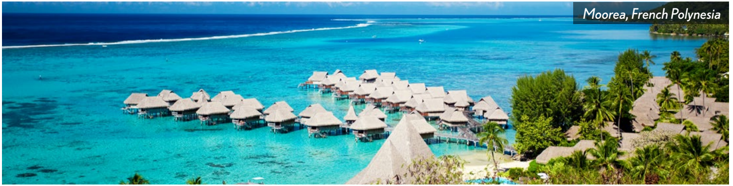
Moorea, French Polynesia