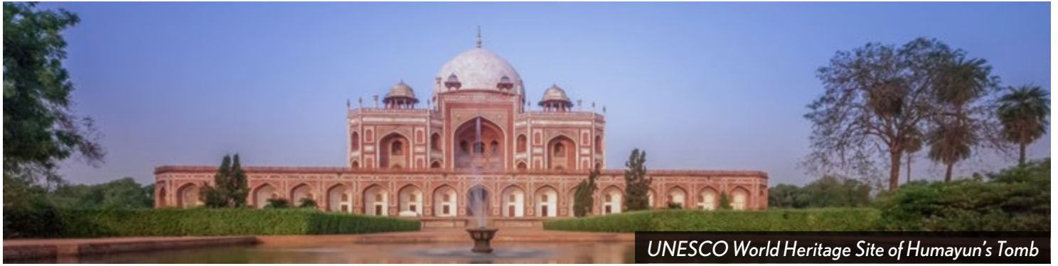
UNESCO World Heritage Site of Humayun's Tomb