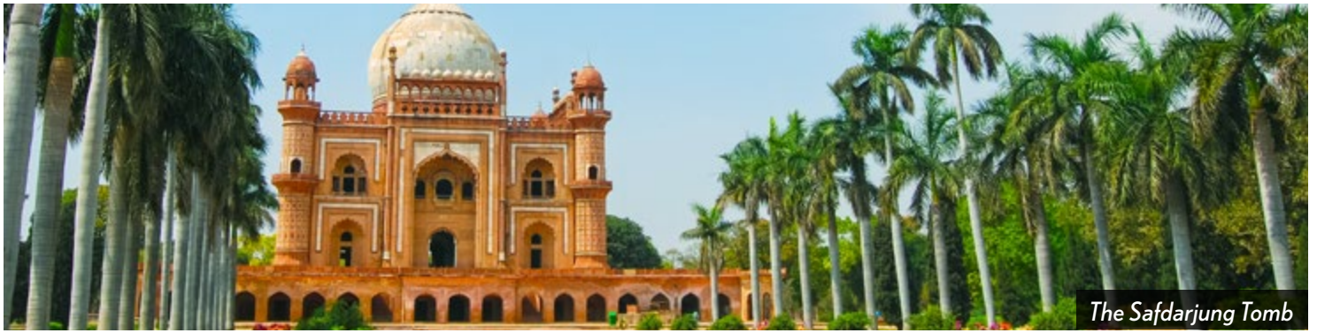
The Safdarjung Tomb

Your Magical India Luxury Adventure vacation already includes the use of a day room at The Leela Gurgaon, New Delhi from 12 pm to 6 pm, on October 23 or, if you opt for our post-trip Vacation Stretcher to Varanasi, on October 26. Most flights into Delhi depart in the late evening, so we made sure you had a day room available for you until 6 pm to shower, re-pack and relax before dinner, before transferring to the airport for your evening flight.