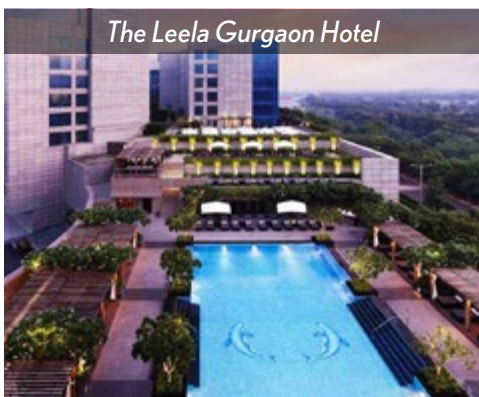
The Leela Gurgaon Hotel