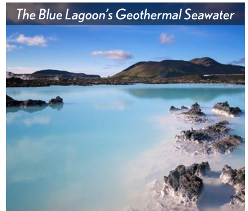
The Blue Lagoon's Geothermal Seawater

The Blue Lagoon's geothermal seawater is known for its positive effects on the skin. The algae have anti-aging properties and the silica strengthens the skin. Combined, they aid in clearing your complexion and having healthy-looking skin.