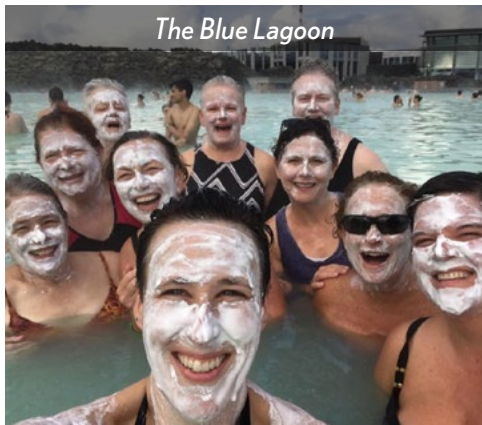
The Blue Lagoon