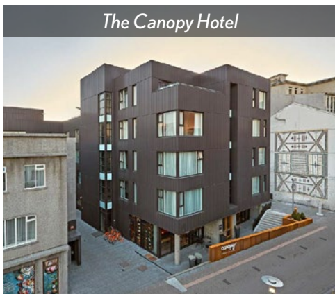
The Canopy Hotel