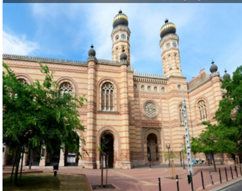
Jewish Quarter, Great Synagogue