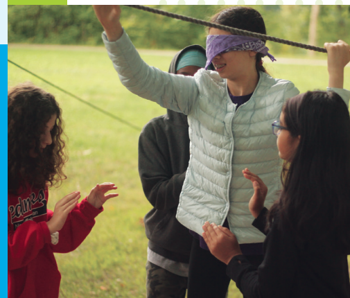
Upper School students on a teambuilding trip at Lake Tecumseh