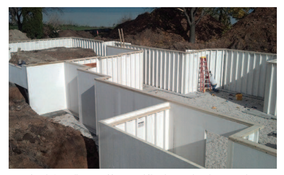
A new foundation-wall system of foam-cored fiberglass panels replaces poured concrete to create warmer, drier, more energy-efficient foundations that reportedly are structurally dependable for the life of the home. On a standard-size dwelling, foundation walls can be erected in less than two hours by crews with standard trade skills and minimal training. The wall system is said to be cost competitive anywhere concrete foundations are installed.

Consumers benefit too with warmer, drier, more energy-efficient foundations that are structurally dependable