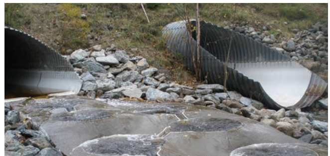
Culvert Rehabilitation & Aquatic Wildlife Passage