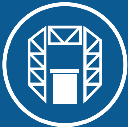
STRUCTURAL FABRICATION SERVICES