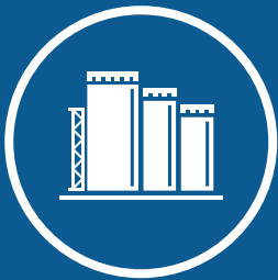
INDUSTRIAL CORROSION MANUFACTURING