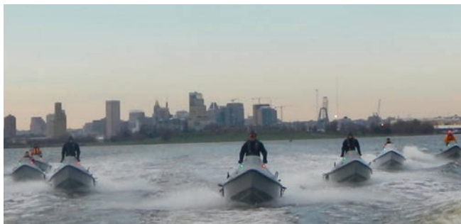
GARC Jet Boat