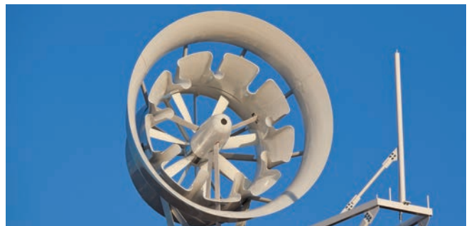
Prototype FRP Wind Turbine

Vacuum Infusion & Specialty Closed Molding | Open Molding & Hand Lamination | Filament Winding | Prepeg Lamination Fiberglass | Carbon | Kevlar | Vinyl Ester | Epoxy Resins | Phenolic Resins