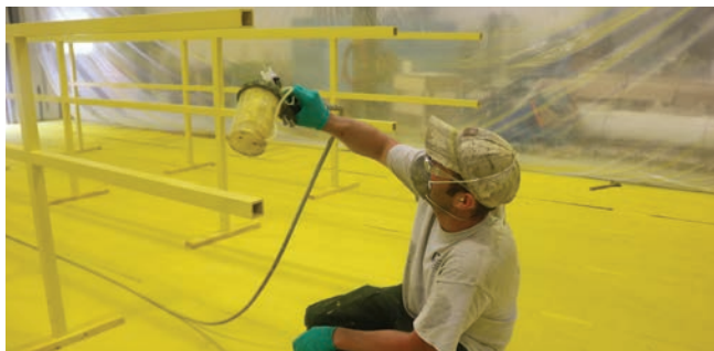
Custom Structural Fab Solutions