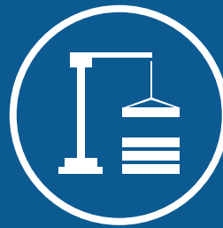
INDUSTRIAL FIELD SERVICE AND REPAIR