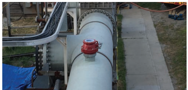
Sewer Line Repairs & Piping Solutions