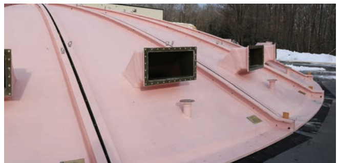
Large Diameter Clarifier Cover