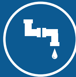
MUNICIPAL WASTEWATER AND ODOR CONTROL