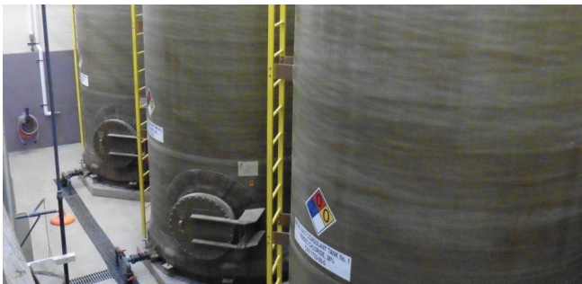
Complete Chemical Tank Solutions