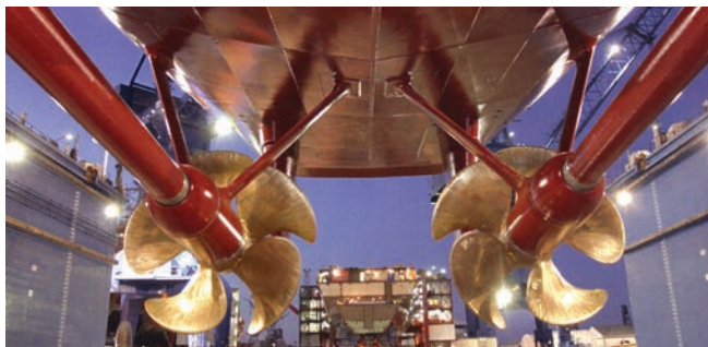
Composite Fairwaters for Large Ships