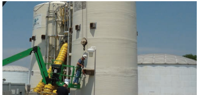
Scrubber Support Beam Placement